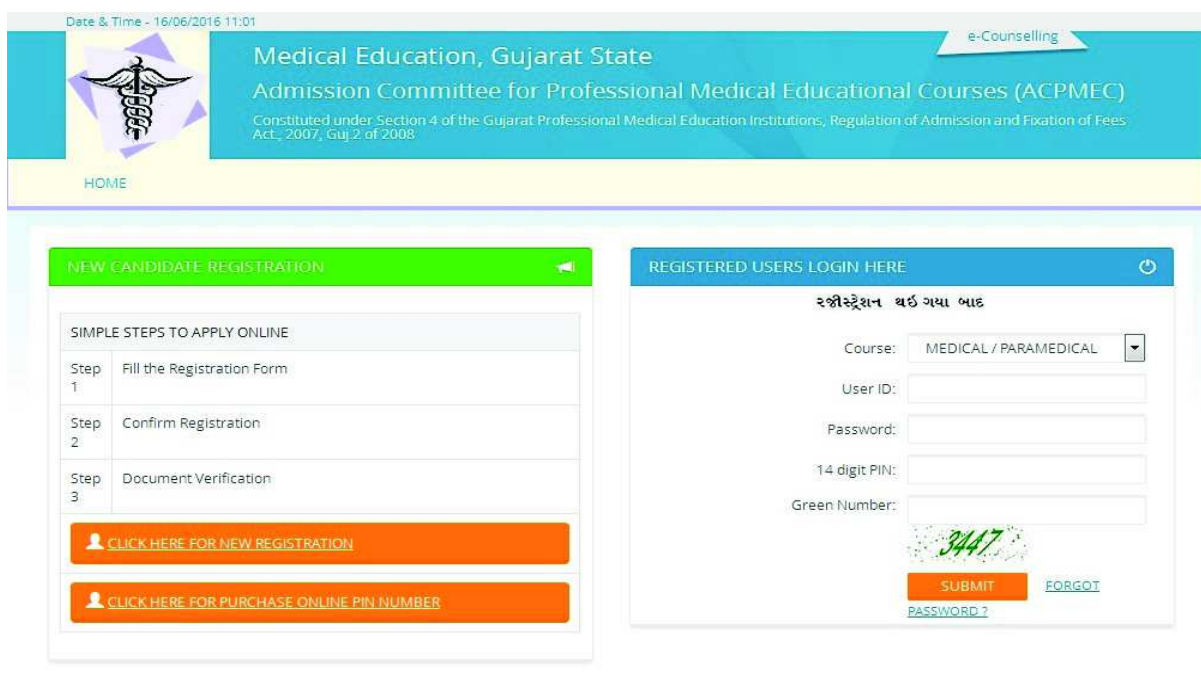
Fig 2.2 Screen of “www.medguj.nic.in” for Online Registration